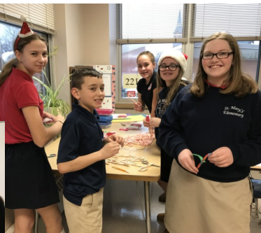
Our SME Student Council

The Student Council also hosted an ugly sweater contest! Here are our winners: