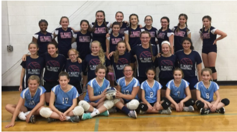
Top row: Varsity 8th grade Middle row: Varsity 7th grade team Front row: JV team

Congratulations to our Girls Volleyball teams for doing so well in the St. Mary's High School volleyball tournament this past weekend! The improvement of ALL of our girls from the beginning of the season was shown throughout this FULL day of volleyball matches!!!