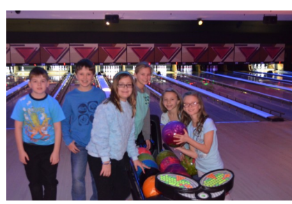
St. Mary's Elementary 2 St. Mary's Hill Lancaster, NY 14086