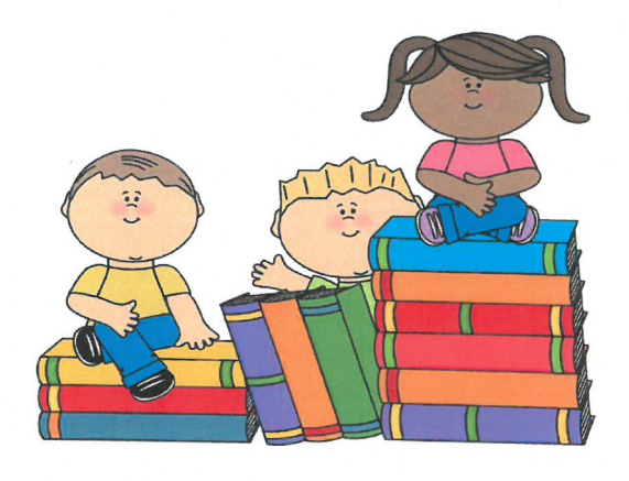
Books <u>must</u> be grade level appropriate!

• This will be a two day process. Day 1: students bring in their books and get a ticket for each book they turn in. Day 2: students exchange each ticket for one book.