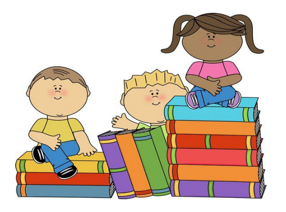
Books must be grade level appropriate!

• This will be a two day process. Day 1: students bring in their books and get a ticket for each book they turn in. Day 2: students exchange each ticket for one book.